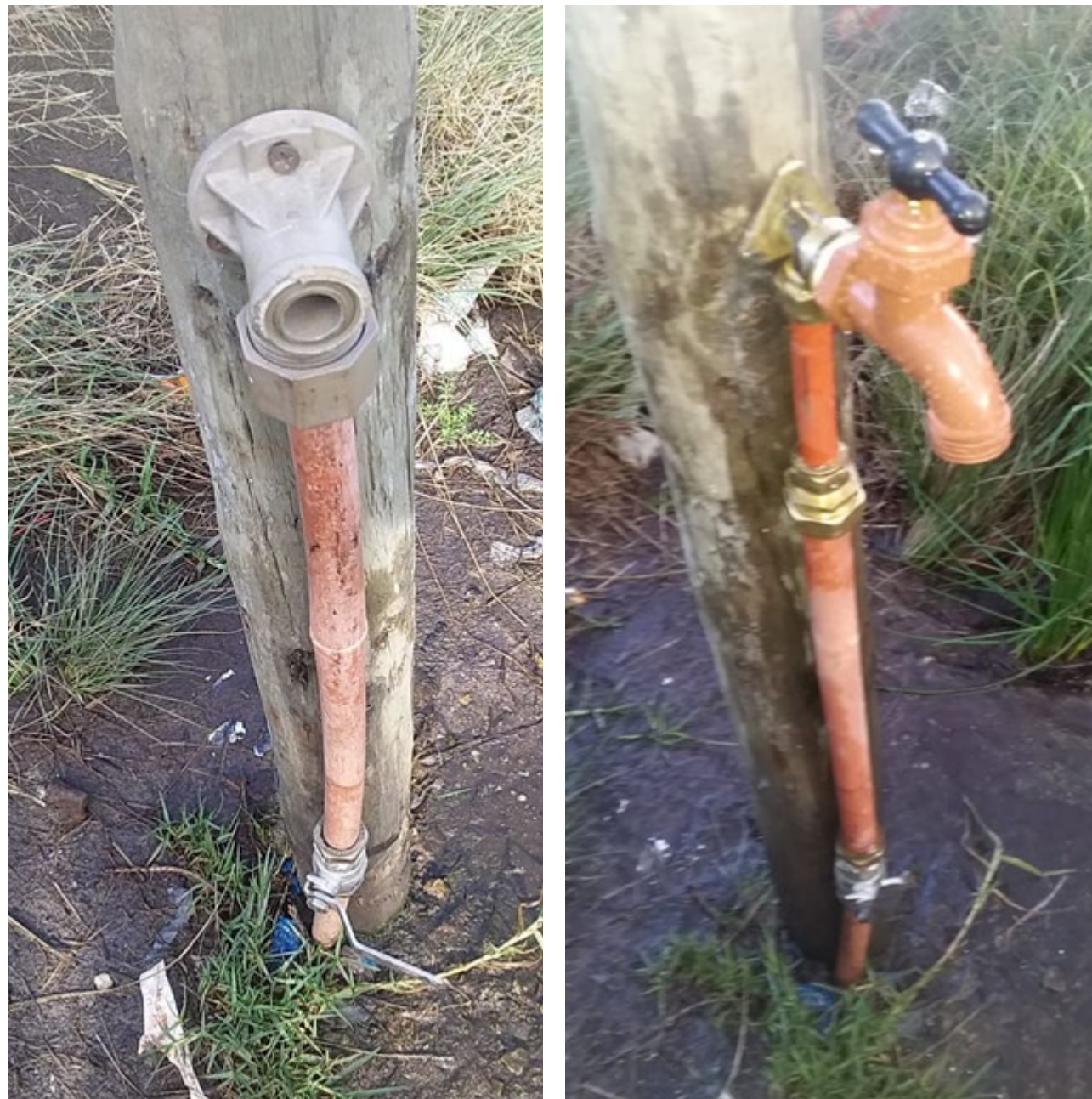
Knysna Newrest Witlokasie residents urged the municipality to fix taps (above left) and some new taps have been installed (above right)

The majority of Knysna informal settlement residents (83%) say they had enough water in the last seven days. But, accessing this water is not easy. Most residents rely on communal taps and 68% say they collect water more than once per day . In some places, like Lokasie, Oukamp, Honey Valley, Sokker Valley and Blade Square, each trip takes longer than 20 minutes.