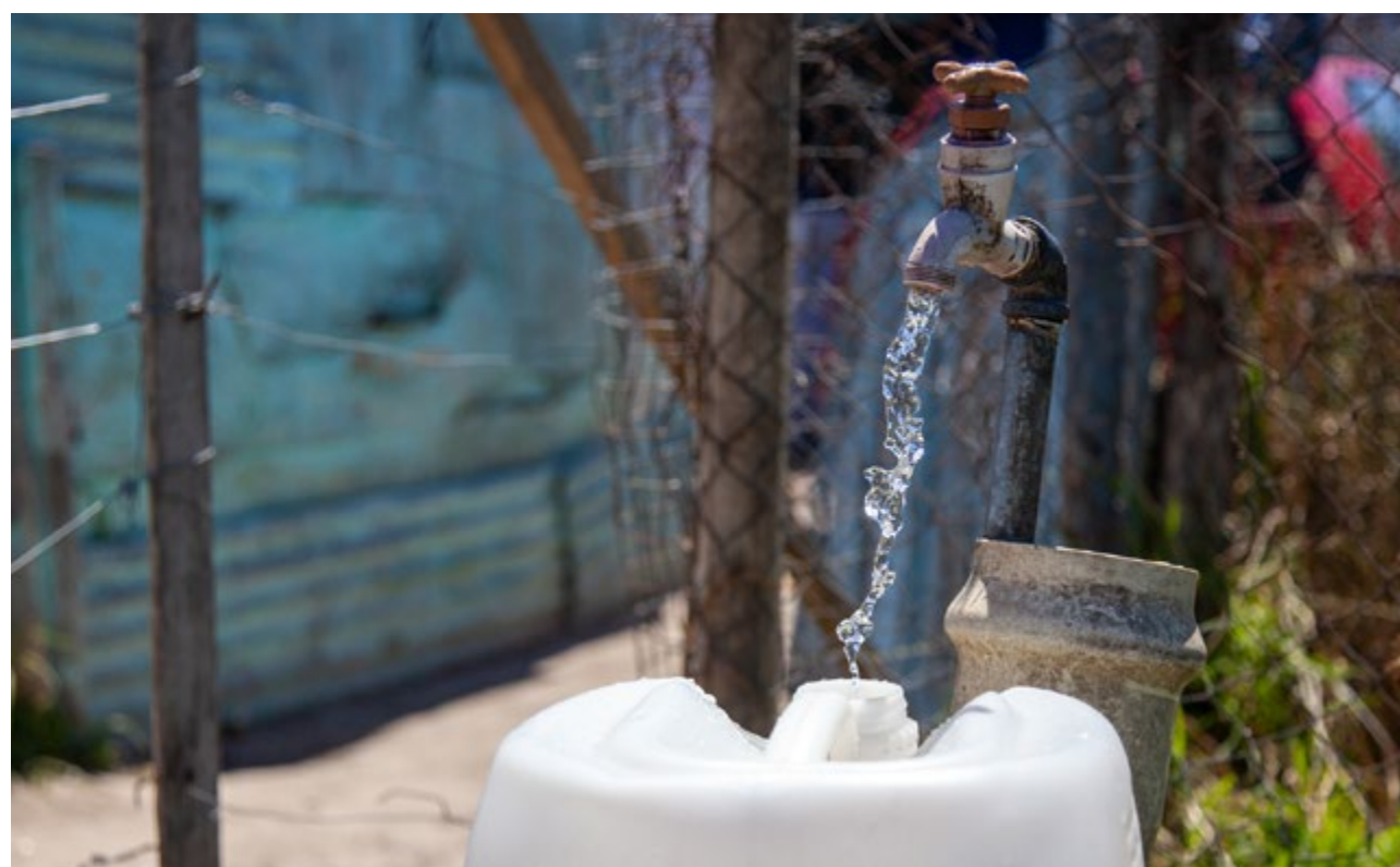
Clean running water should be available and easily accessible to all

GOOD NEWS • In Lankgewag , all residents said they have enough water in the last 7 days • In Bergvallei, Blade Square and Lankgewag residents' comments reflect general satisfaction with the quality of water