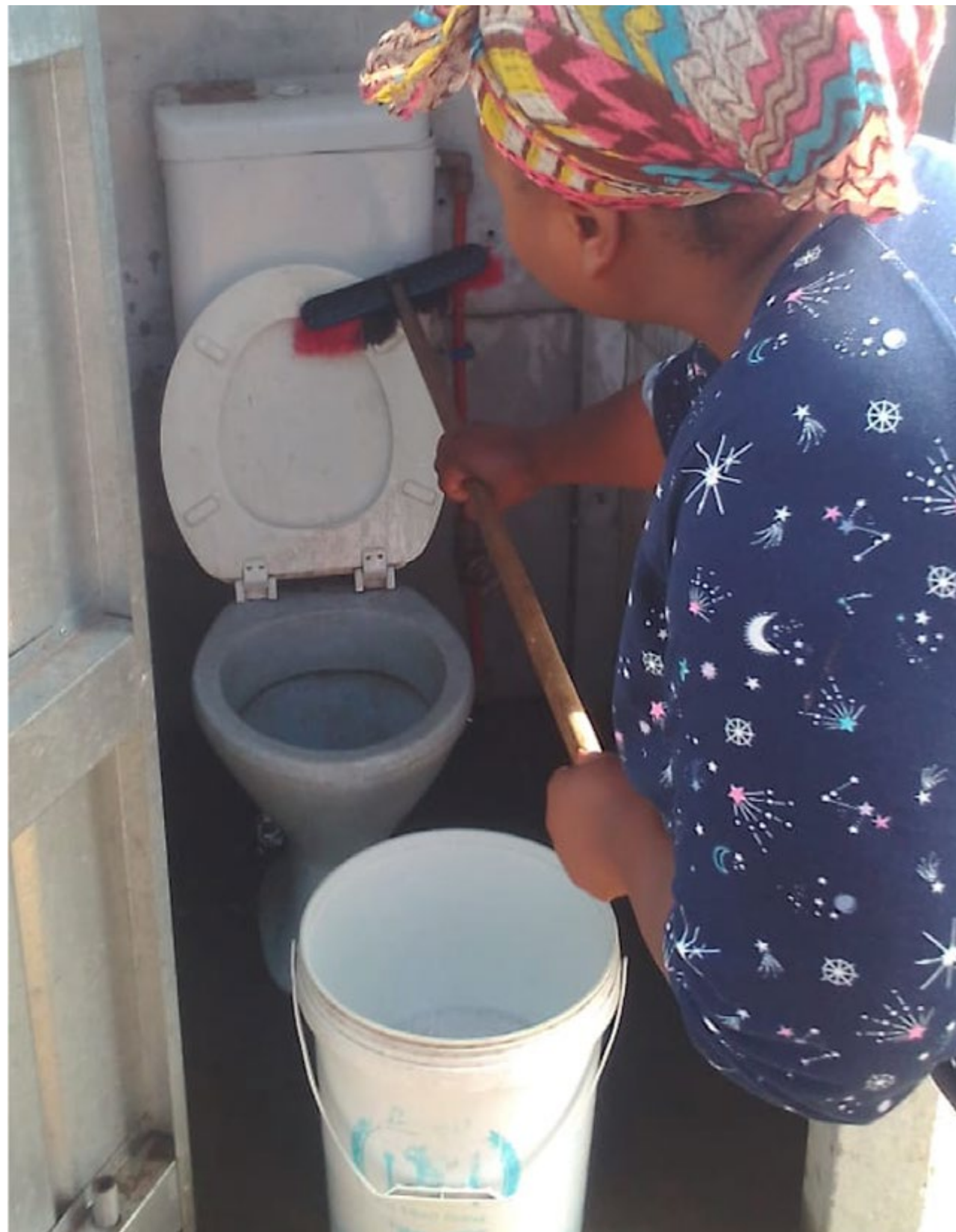
Community member in Smutsville, Knysna cleaning toilets