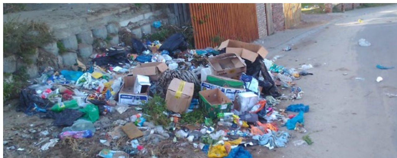
Waste after truck had been having only collected waste in black bags

We covered almost half of the informal settlements in Knysna this month. The results show that the toilet cleaning service is infrequent or absent in many places. Waste access is limited and waste is not being collected in several communities. As residents prepare to engage the municipality, they have identified priorities that should be addressed for each service: