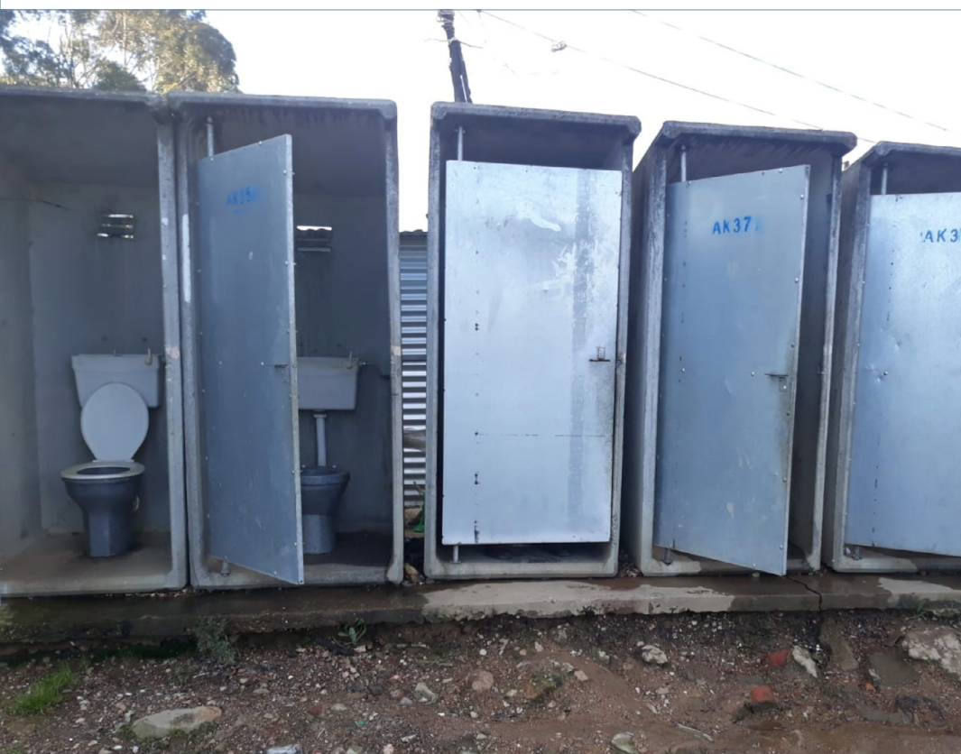
Toilets recently repaired and cleaned in Asla Kamp, Tulbagh by Witzenberg Municipality

This 4th release for the Asivikelane Western Cape comes at very tumultuous time in South Africa – Covid-19's spread has necessitated a level 4 lockdown, civil unrest has destabilised parts of the country and taxi violence has gripped the Western Cape. Unequal access to resources and infrastructure are some of the drivers for this unrest. Many communities are disillusioned and frustrated by a government that does not seem to care about their right to basic services like water and sanitation. This is a ticking time bomb which government can no longer ignore.